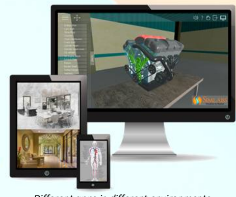
Different apps in different environments